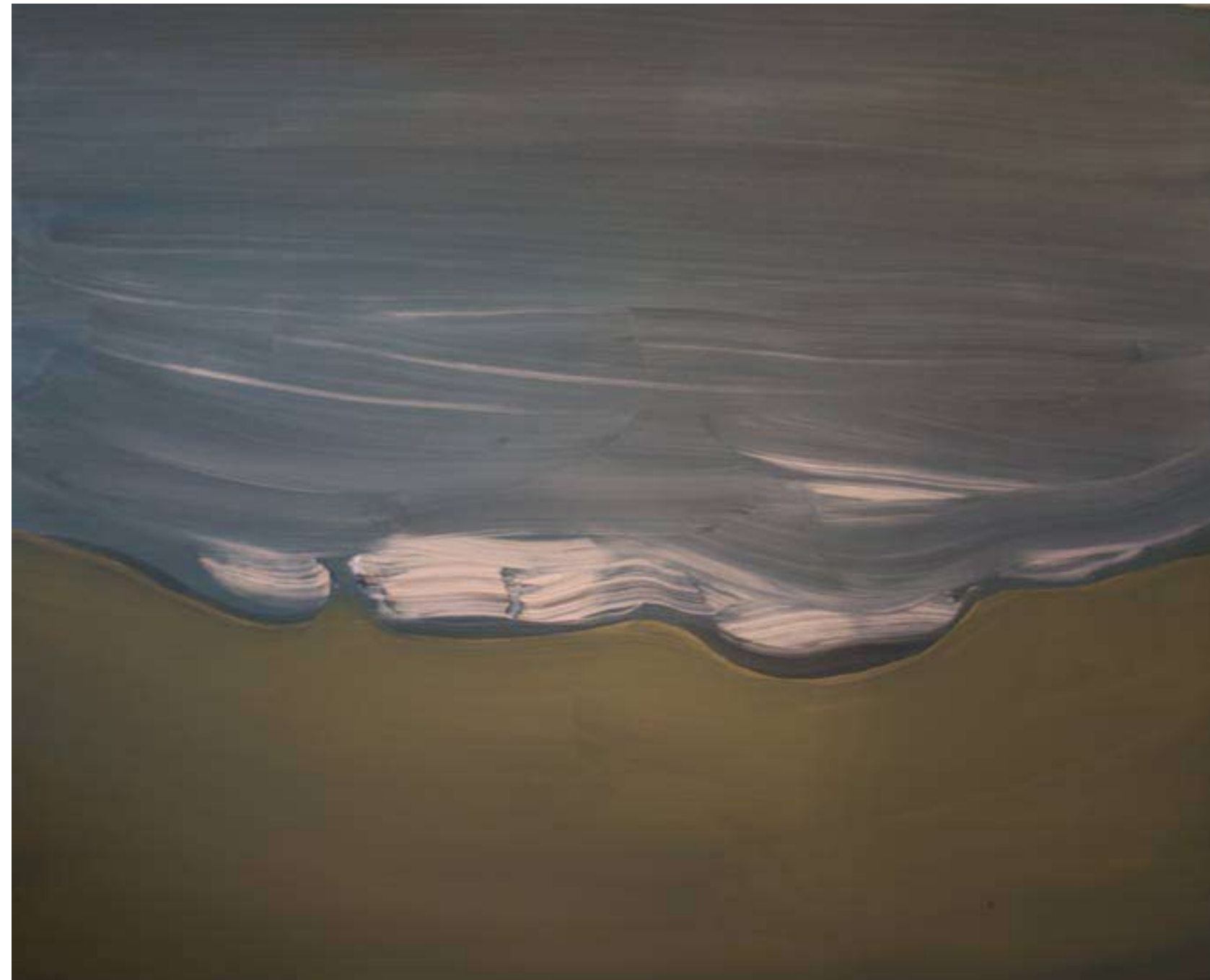
←← PAYSAGE PLUVIEUX , 2008 OIL ON CANVAS 22,5X18,5 IN. / 58X48 CM.